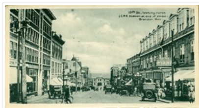
Brandon street cars in front of Winter Fair Building on 10th Street