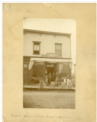
South Street, Hudson River, Poughkeepsie