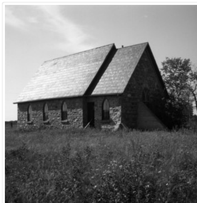
Church of St. Albans - Blenheim (Anglican), south of Birtle,