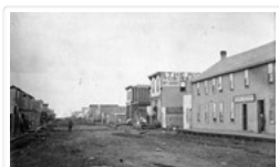
Queen's Hotel on the corner of 10th Street and Rosser Avenue http://archives.brandonu.ca/en/permalink/descriptions13778

Part Of: Fred McGuinness collection Description Level: Item