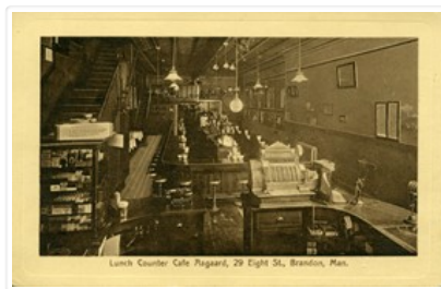
Lunch Counter Cafe Aagaard, 29 Eighth St., Brandon, Man.