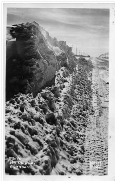
Part of Highway Clearing