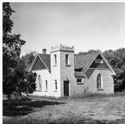
Bethel Church (1895) on Highways 2 & 21 west of Deleau, Manitoba.