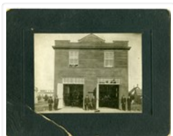
Brandon Fire Station No.2 with wooden exterior http://archives.brandonu.ca/en/permalink/descriptions13995

Part Of: Fred McGuinness collection Creator: Photography: J.W. Wilson Co., 143 Queen W., Toronto Description Level: Item