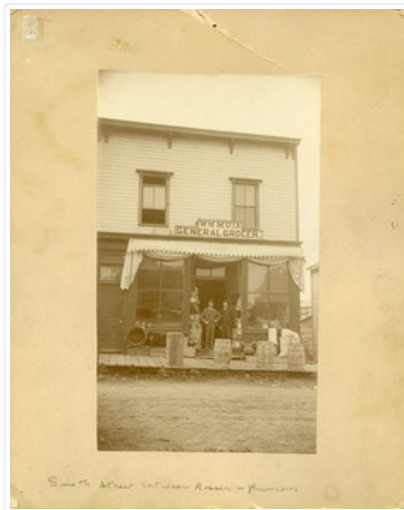
Street scene 8th Street in winter