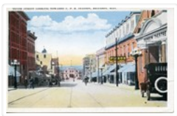
Tenth Street looking towards CPR Station, Brandon, Man. http://archives.brandonu.ca/en/permalink/descriptions13780

Part Of: Fred McGuinness collection Description Level: Item Series Number: McG 9 Item Number: 20-2009.91