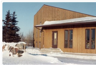
Christmas Tree Farm - house, overview