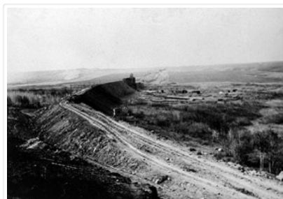
Great Northern (BS&HB) Railway overpass east of Bunclody