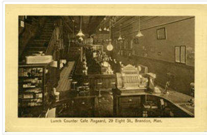
Lunch Counter, Cafe Regard, 29 Eight St., Brandon, Man.