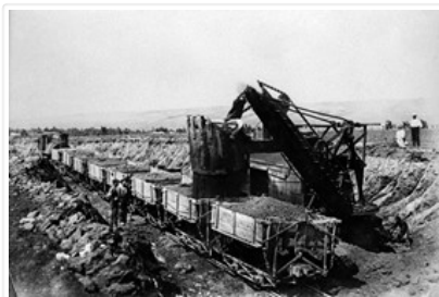
Great Northern (BS&HB) Railway Construction Camp near