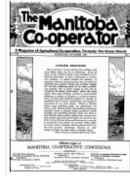
The Manitoba co-operator