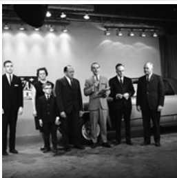
Windfall car winner