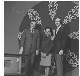
Winners of color month TV's