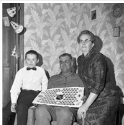
Wilson family (Crystal City), Coca-Cola winners