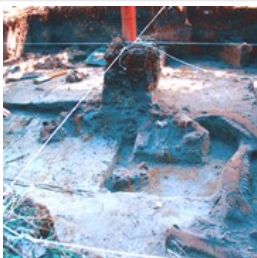
Sarah site 2003 - XU 6 - 9 ...