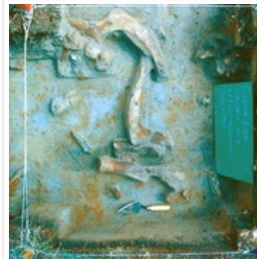
Sarah site 2003 - bone bed in XU ...