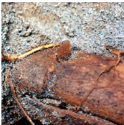
Sarah site 2003 - projectile point in rib