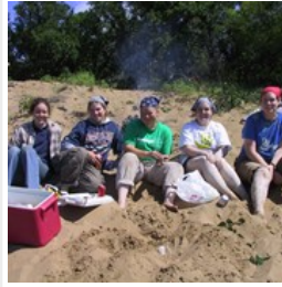
Atkinson II site 2004 - crew celebrating the ...