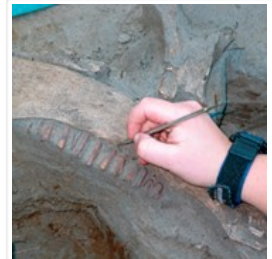
Sarah site 2003 - Excavating a mandible with ...