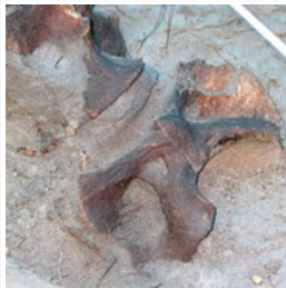
Sarah site 2003 - XU 9 vertebrae