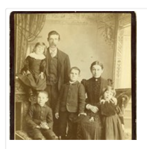
Formal family portrait