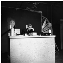
Sorry Wrong Number