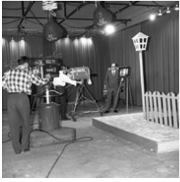
The Smith Lumber Show