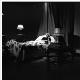
Sorry Wrong Number