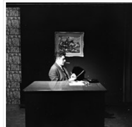
Sorry Wrong Number