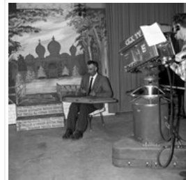
The Smith Lumber Show