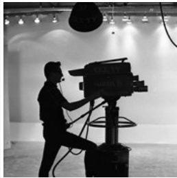
Studio camera ID