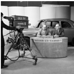
The Question Is?