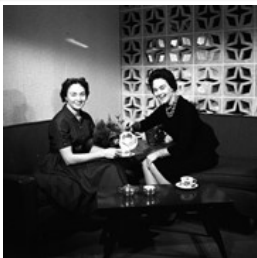
Two for Tea