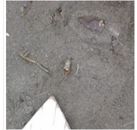
Crepeele site 2005 - XU 12 projectile point