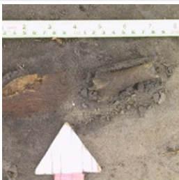
Crepeele site 2004 - bison humerus