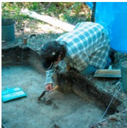
Crepeele site 2003 - Emily Ansell excavating