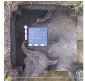
Crepeele site 2004 - bison skull