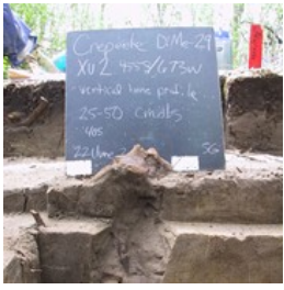
Crepeele site 2004 - Vertical bone feature