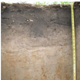
Crepeele site 2005 - XU 14 wall profile