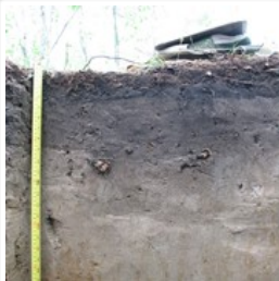
Crepeele site 2005 - XU 14 north wall ...