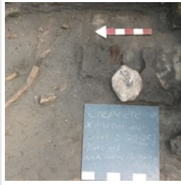
Crepeele site 2007 - XU 36 feature