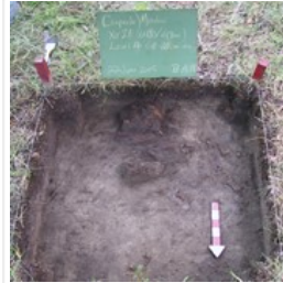
Crepeele site 2005 - XU 21 feature