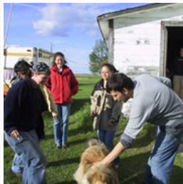
Crepeele site 2004 - Crew in camp