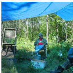
Crepeele site 2008 - tea break