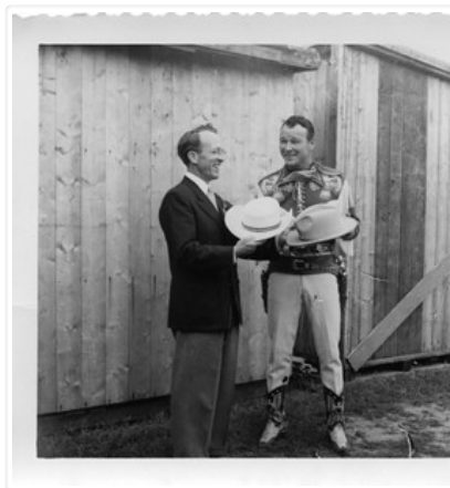
Roy Rogers with Tommy Douglas

http://archives.brandonu.ca/en/permalink/descriptions14087