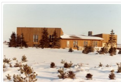
Christmas Tree Farm - back of house